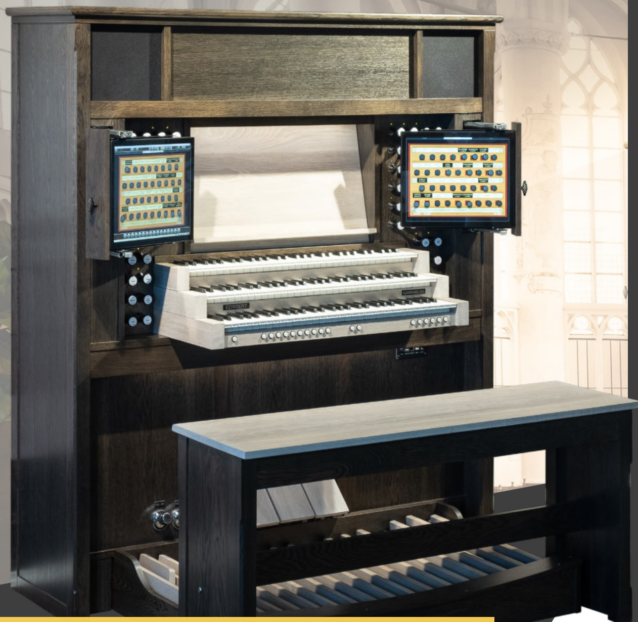
Content Cambiare 335

The eye-catcher in our Hauptwerk™ collection is the Cambiare 335. This organ has an extensive internal audio system and wooden draw stops complete the unique church organ experience!