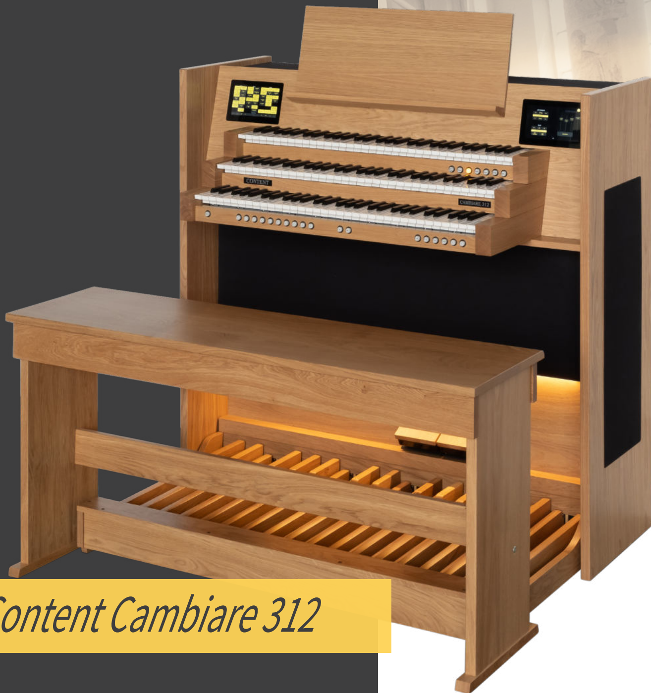
Content Cambiare 312